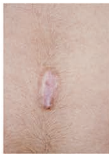
Follow up at six months after one session of cryosurgery and six weeks of application of Alhydran