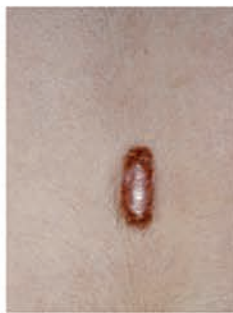
Keloid of the trunk pre operative view

Cryoshape and Alhydran showed a good synergy in the management of pathologic scars. Further, well-designed trials should be carried out to determine the effectiveness of Alhydran in improving scars outcome