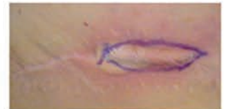
Immediate post operative