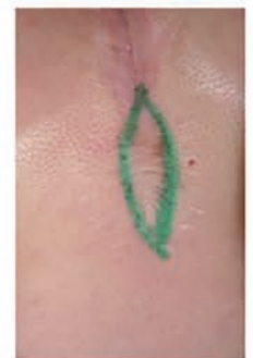
Pathologic scars of mediastinum sequel of cardiac surgery: pre operative view before cryosurgery