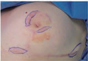
Close up of the scars to be treated (left breast).