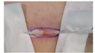
Intraoperative view: you can note the freezing of the scar