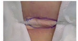
Scar completely frozen.