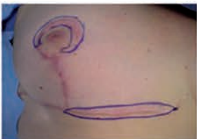
Close up of the scars to be treated (right breast).